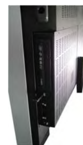
Built in PC and Blu-ray player

With the CleverLCD Touch Plus you have everything in one product to make your classroom ready for the future. The powerful PC with Athlon dual core processors, the HD ready, full 1080p LCD display, the in-built Blu-ray DVD ROM, the lively speakers and not least the integrated interactive surround letting you take complete control of the screen, just using your finger. Gone are bright lights, annoying body shadow, routine maintenance, dim displays and poor quality images. No expensive projector lamps to replace and you can keep the blinds open! Children find the screen easy to use, and teachers welcome the instant operation, with no need to connect cables.